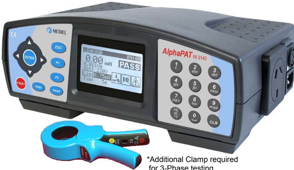
*Additional Clamp required for 3-Phase testing

Lightweight, but powerful portable appliance tester proving popular in all industry sectors including hire companies with both New Zealand and Australia's largest companies purchasing this model.